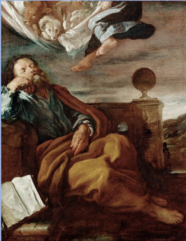
St Peter's Dream (Acts 11) :: Fifth Sunday of Easter Domenico Fetti (1619)

www.standrewskentct.org * 860.927.3486 * st.andrew.kent@snet.net